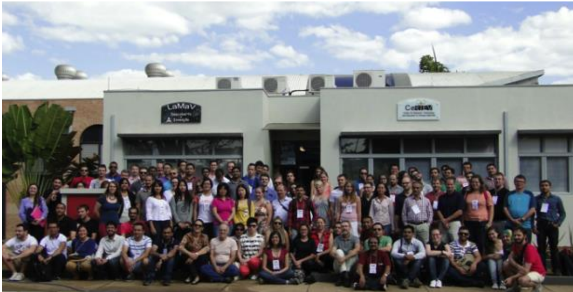
Vitreous Materials Lab (LaMaV) at Federal University of São Carlos ( lamav.weebly.com ). Instructors and attendees of the First School (2015) with 70 international students and 30 Brazilians.